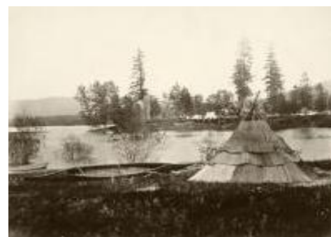
Teepee and Canoe - Pend Oreille River, 1860