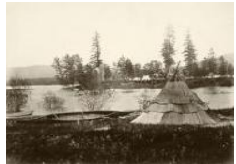
Teepee and Canoe - Pend Oreille River, 1860