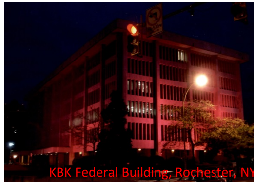
KBK Federal Building, Rochester, NY

October 23-31 Red Ribbon Week The nation's oldest and largest drug abuse prevention awareness program.