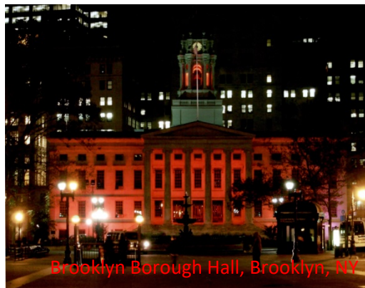
Brooklyn Borough Hall, Brooklyn, NY

Go Red for Red Ribbon brings awareness to living a drug-free life by lighting up buildings, landmarks, businesses, and bridges in red!